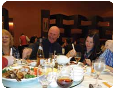
The LOVE, CARE, DREAM dinner hosted by the Vancouver Chinatown Lioness Club

Vancouver Chinatown Lioness Club organized and hosted the LOVE, CARE, DREAM dinner on November 6th for SOS Children and raised $11,500.