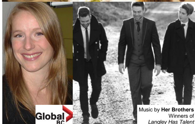
Music by Her Brothers Winners of Langley Has Talent